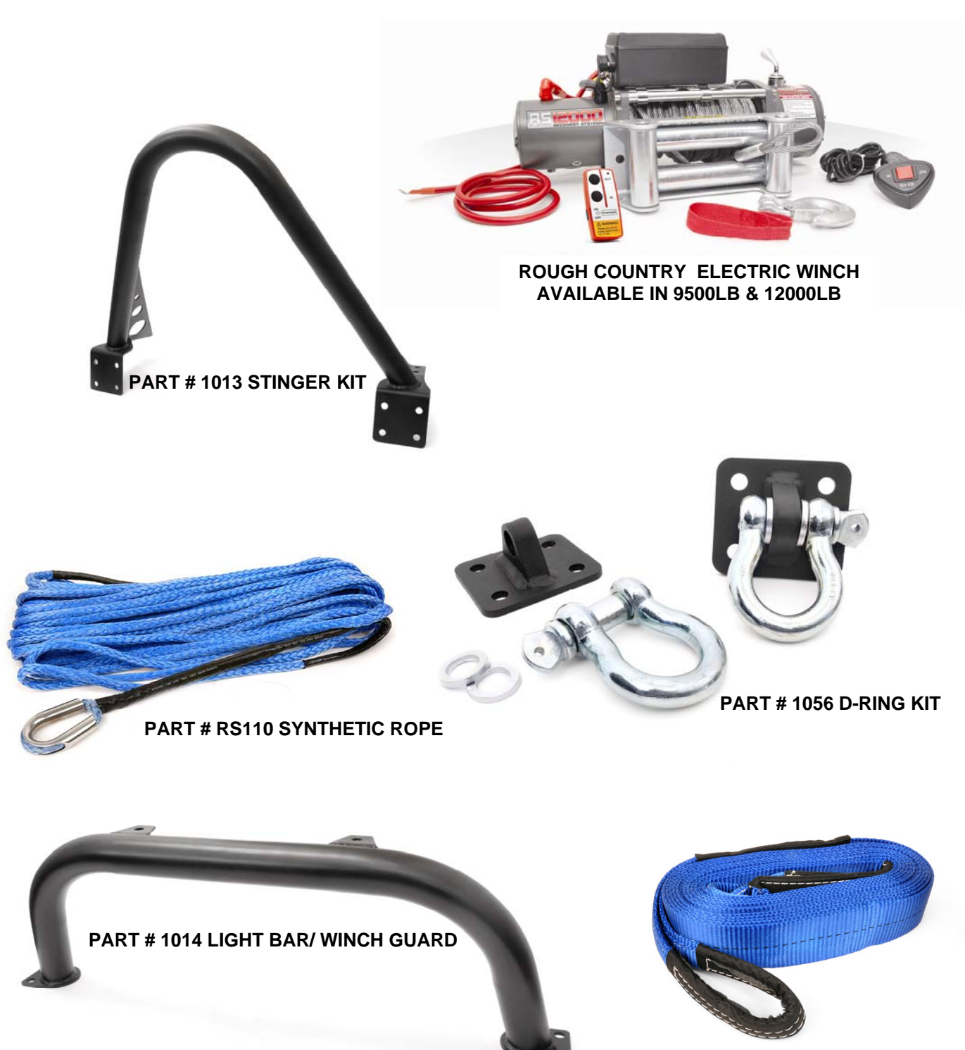
PART # RS120 WINCH EXTENSION STRAP

THANK YOU FOR CHOOSING ROUGH COUNTRY FOR YOUR OFF ROAD NEEDS.