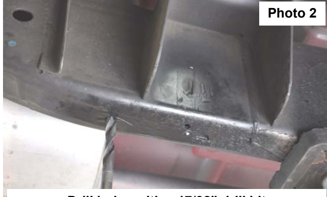
Drill holes with a 17/32" drill bit