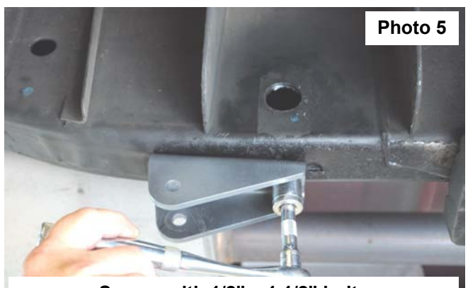
Secure with 1/2" x 1 1/2" bolts

Install traction bar bracket using the supplied 1/2" x 1 1/2" bolts and tighten bolts using 19mm socket. See Photo 5. 5. With rear end supported remove nuts from the u-bolts and install lower traction bar bracket as shown in Photo 6 6. under the u-bolt plate. Tighten all u-bolts nuts using 22mm socket. Lower the truck to install traction bars.