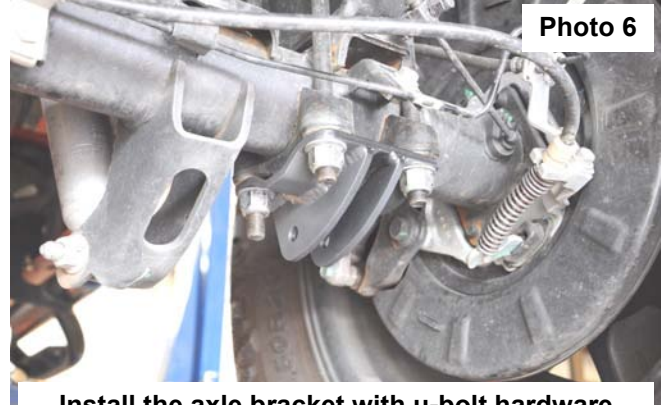
Install the axle bracket with u-bolt hardware

Install the supplied hiems joint into traction bars leaving the jam nut loose. Use the supplied 12mm x 75mm bolt for 7. front mount. Hand tighten. See Photo 7 & 8.