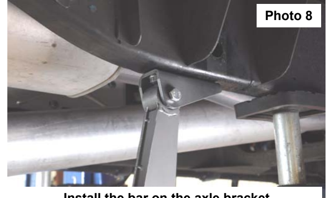
Install the bar on the axle bracket