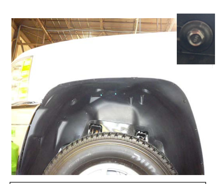
STEP 5: Place the Fender Flare on the vehicle into the position of best fit. Note where the slots in Fender Flare align with the existing screws in the vehicle. Remove Fender Flare. Use the original manufacturer's hardware that is in the wheel arch of the vehicle to fit the Fender flares. Remove the x6 9/32" (7mm) socket head screws from the fasteners on the vehicle.