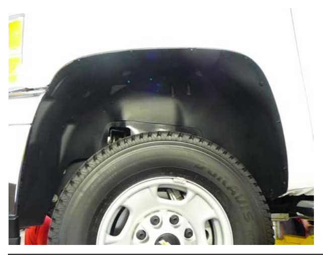
STEP 4: Clean the body areas where the Fender Flares will make contact. Ensure fenders are dry prior to install.