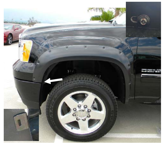
STEP 6: Place the front Fender Flares onto the vehicle and line up the holes on the part with screw holes on the vehicle. Re-Install the socket head screws into the fender to secure the Fender Flares. Fit Fender Flares loosely until the Fender Flares are aligned as desired, when satisfied tighten the screws fully to ensure rubber seal is flush neatly against the body. Attach the provided U shape clip by positioning the clip so that the clip barb locates in the slot of the Fender Flare as shown.