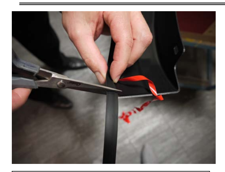
STEP 3: Trim any excess rubber seal and discard.

Bolt-On/Rugged Fender Flares GMC Sierra HD 2500/3500 (07-14) FIT-FF743