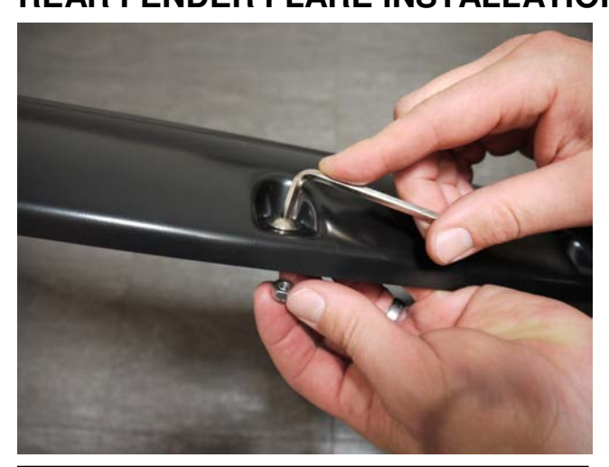
STEP 7: Attach the 11 bolts, washers and nuts to each Fender Flare using a 3/16" Allen key and a 10.0mm wrench/socket. (wrench/socket and Allen key not supplied). Ensure inside of Fender Flares where the rubber seal is attached is clean, using the alcohol wipes provided. Wipe away any residue with a dry clean cloth.