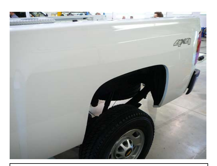
STEP 10: Clean the body areas where the Fender Flares will make contact. Ensure fenders are dry prior to install.