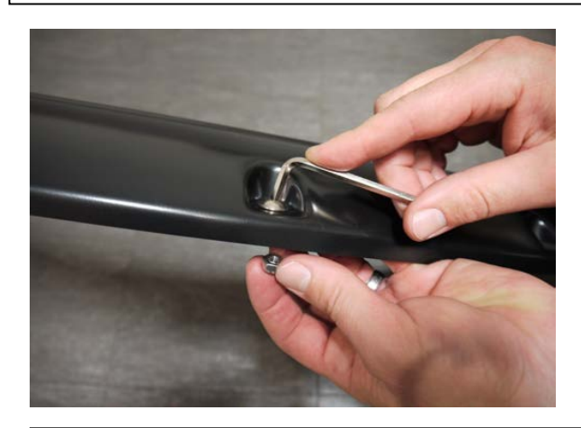
STEP 1: Attach the 9 bolts, washers and nuts to each Fender Flare using a 3/16" Allen key and a 10.0mm wrench/socket. (wrench/socket and Allen key not supplied). Ensure inside of Fender Flares where the rubber seal is attached is clean, using the alcohol wipes provided. Wipe away any residue with a dry clean cloth.

PAINTING INSTRUCTIONS – If Fender Flares are being painted; do not install edge extrusion until painting is complete. Prior to painting, clean all surfaces to be painted using clean water and a mild detergent, do not use lacquer thinner or any solvent based products. Wipe completely dry. Best results will be achieved by wiping the areas to be painted with a tack rag just prior to painting. Most automotive paints can be applied directly to the Fender Flares, however some may require a primer (check paint manufacturer specifications). Good adhesion will be achieved without sanding. Select a paint (and primer if necessary) that is suitable for rigid plastics PMMA (Acrylic). If using a paint system that requires baking, do not expose the product to temperatures above 70°C (158°F). Do not fit the extrusion or any of the hardware to the Fender Flares until the paint is completely dry.