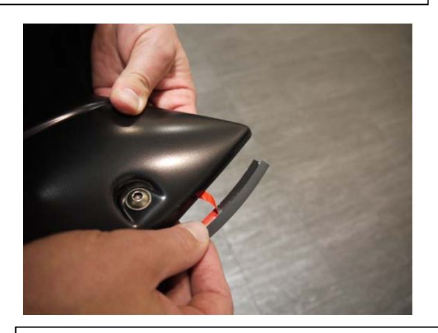
STEP 2: Attach the included rubber seal to the Fender Flares. Peel back 2" of the adhesive backing and position on the Fender Flare. Attach the seal to the Fender Flare, peeling back a few inches at a time. Ensure pressure is used to secure rubber seal to Fender Flare edge. Attach rubber seal along all areas the Fender Flare will make contact with the vehicle body.