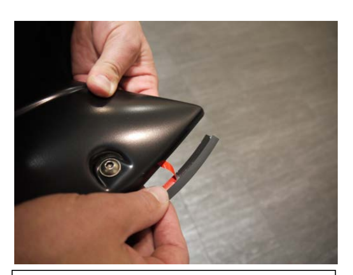
STEP 8: Attach the included rubber seal to the Fender Flares. Peel back 2" of the adhesive backing and position on the Fender Flare. Attach the seal to the Fender Flare, peeling back a few inches at a time. Ensure pressure is used to secure rubber seal to Fender Flare edge. Attach rubber seal along all areas the Fender Flare will make contact with the vehicle body.